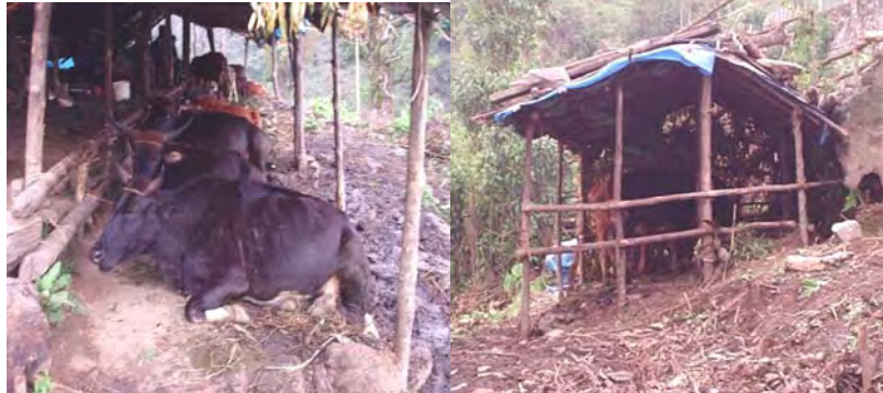
Fig. 2 Temporary housing of cattle at the village farms Breeding management

Most farms (67 percent) had temporary housing for adult cattle and calves made of wooden poles, singles (crudely-made planks) with bamboo mat and plastic sheet for roofing. Sixteen percent had semi-permanent houses made of roughly finished timber, with stone or plank flooring. Rooves were made of bamboo mat or banana leaf, which were invariably covered with plastic sheet (Fig. 2). The external plastic sheets were clamped with poles, tree branches and stones. Seventeen percent of farms did not have housing for adult cattle but had temporary sheds for calves.